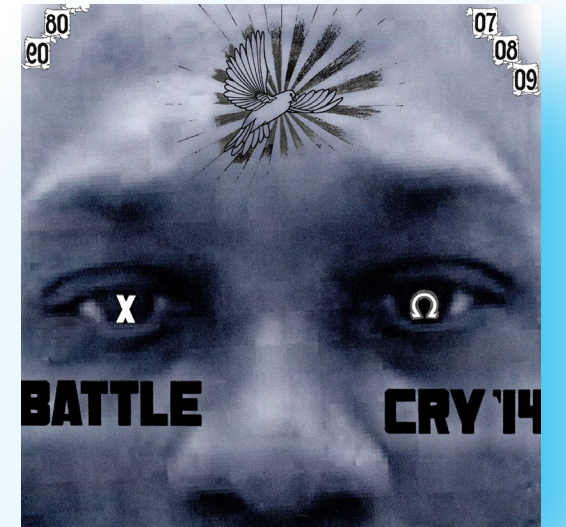
Territorial - Battlecry '14