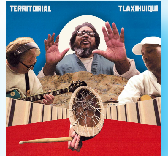
Territorial - Tlaxihuiqui